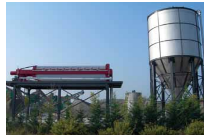
Filterpress and deep cone thickener tank