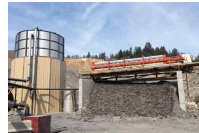
Filterpress with compressed cake