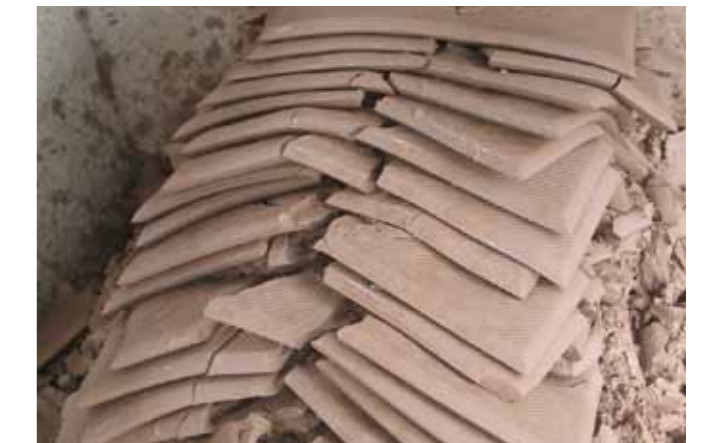
Compressed cakes ready for reuse or disposal