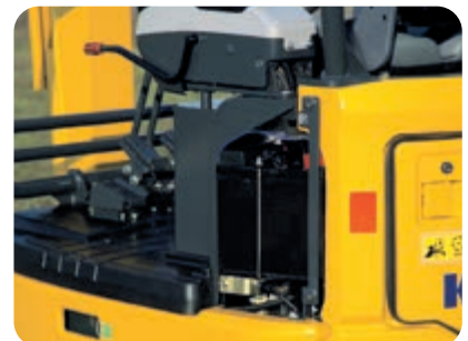
Left bonnet: easy access to the battery refilling