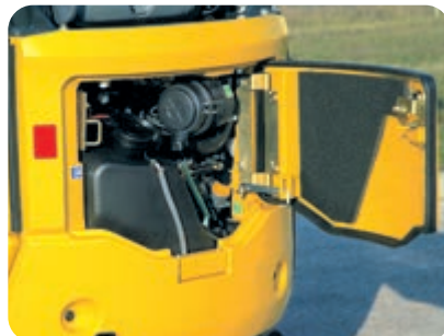
Rear bonnet: quick engine check and fuel tank refilling