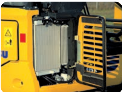
Right bonnet: simple inspection and cleaning of the radiators

ORFS hydraulic face seal connectors and DT electrical connectors enhance the machine's reliability and makes repairs faster and easier. Special technical solutions have allowed the interval for most ordinary maintenance operations, such as pin greasing and engine oil changes, to be extended to up to 500 hours.